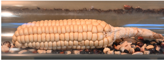
Ears of corn

Hint: Archaeology gallery & Native Peoples