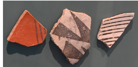
Potsherds (broken pottery)

Hint: Archaeology gallery & Native Peoples