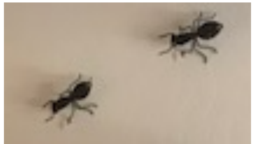
Ants crawling on the wall