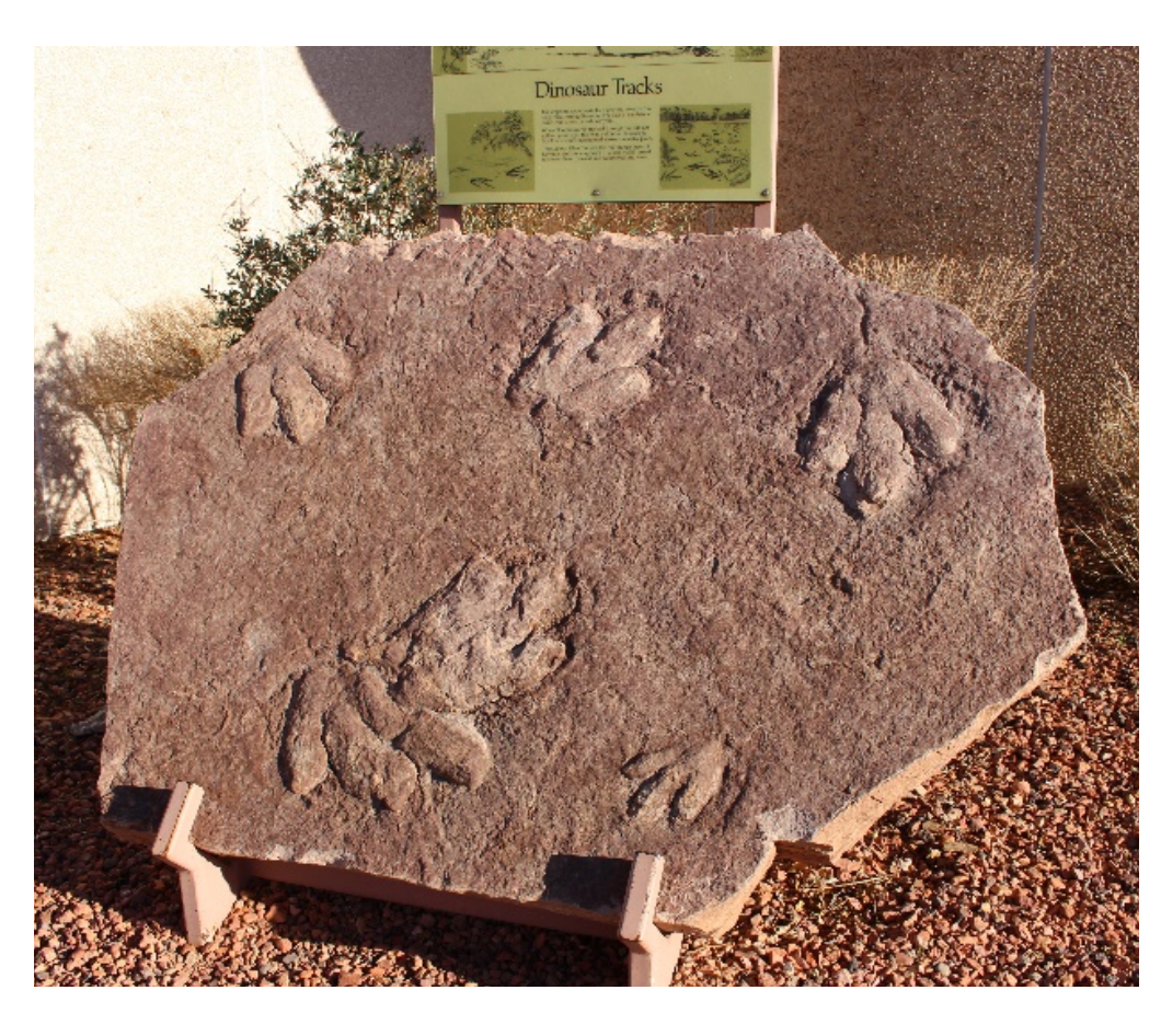
These tracks are an outdoor display at Glen Canyon Dam near Page, Arizona. These were made by a very large individual, probably Dilophosaurus .