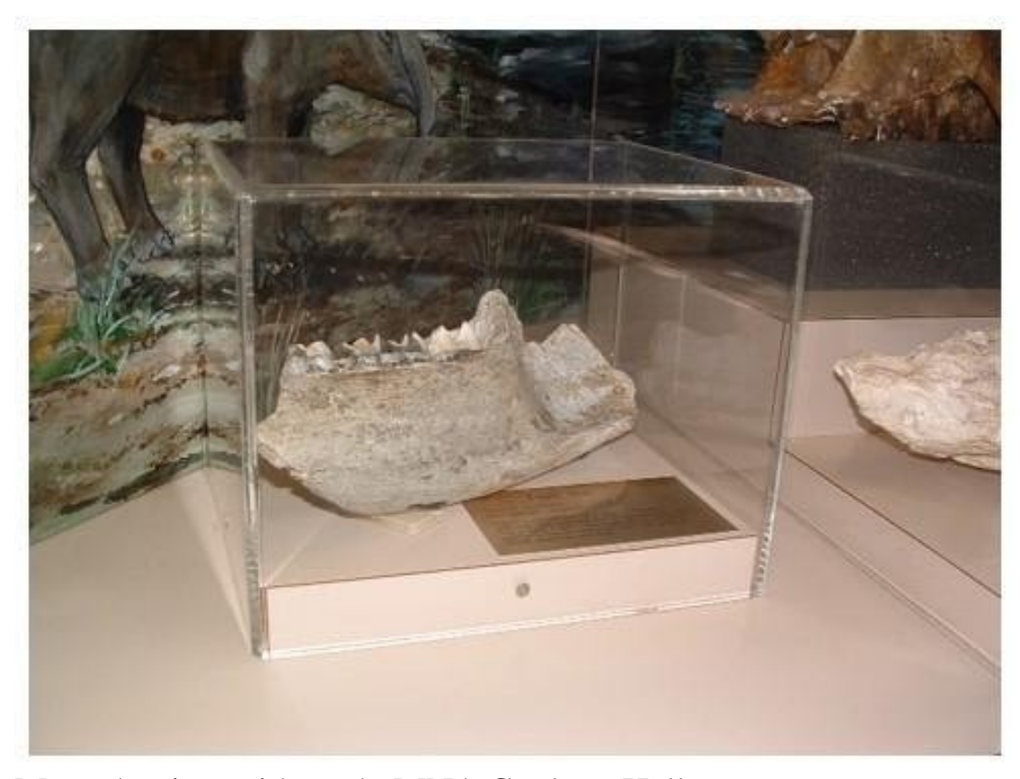
Mastodon jaw with teeth, MNA Geology Hall