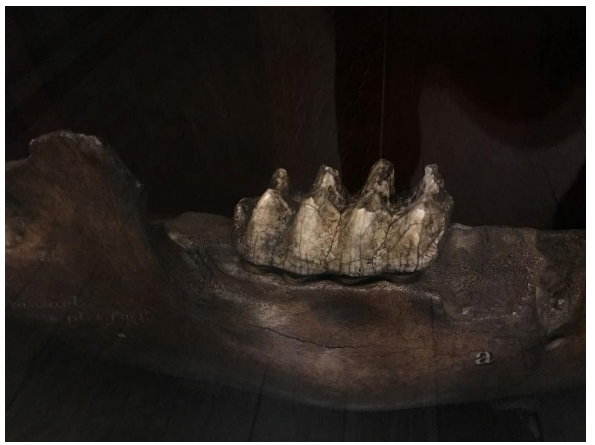
Dave Gillette, British Museum (Natural History)

Mastodon lower jaw from the side, showing one tooth.