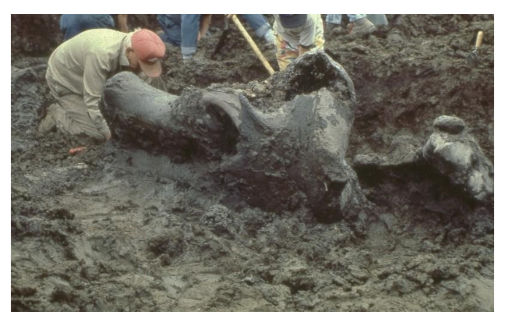
(Answer to pg. 4 question: they ate different food. Mammoths ate mainly grass; mastodons ate mainly leaves from trees).

This is the skull of the Huntington Mammoth lying on its side in the mud of an Ice Age bog before we covered it with plaster and burlap.