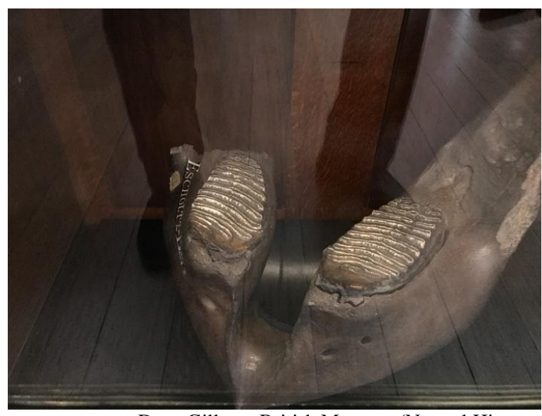
Dave Gillette, British Museum (Natural History)

Mammoth lower jaw with one tooth on each side. The enamel ridges are for grinding food.