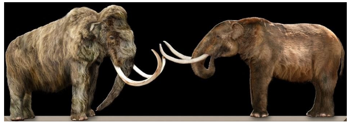
Mammoth (left) and Mastodon (right)

Two kinds of elephants lived in North America. One, the mammoth , is a close cousin to today's elephants in Africa and Asia. The other, called the mastodon , is an extinct line of elephants that was different from mammoths. They both lived in Arizona. You can tell them apart by their teeth.