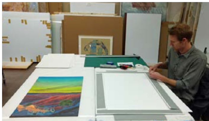
Below - MNA Conservation Technician Jake Fischer works on a presentation mat.

Southwestern Foundation to conduct pilot tests on techniques and determine time required to create a presentation mat. The presentation mats will be made out of two pieces of acid-free, four-ply cotton rag mat board. The top mat board will have a window cut so the art can be seen without disturbing it. Unbuffered interleaving tissue is placed between the art and the top window mat to protect the surface from potential abrasion.